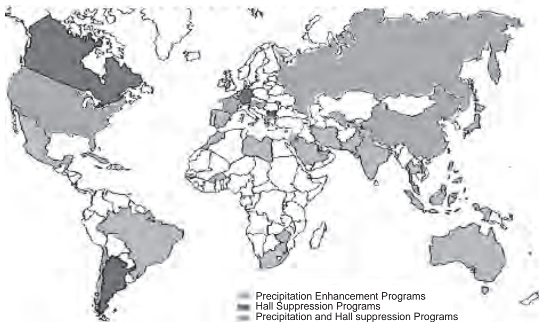
Weather Modification Around the World